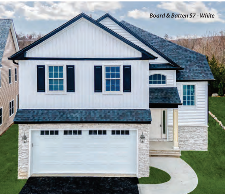
Board & Batten S7 - White

A sound investment that can help increase the resale value of your home.