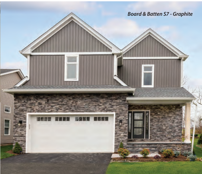
Board & Batten S7 - Graphite